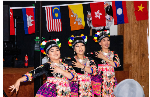
Hmong dancers at the Night Market