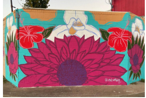
"Dahlia Con Amigos" mural

Hosted two community clean-up days with over 25 volunteers